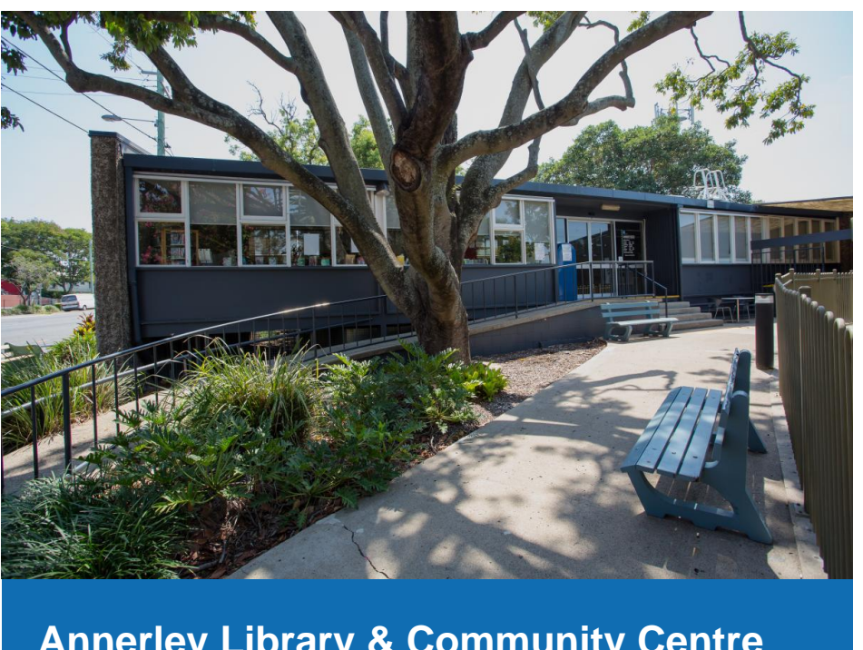
Annerley Library & Community Centre