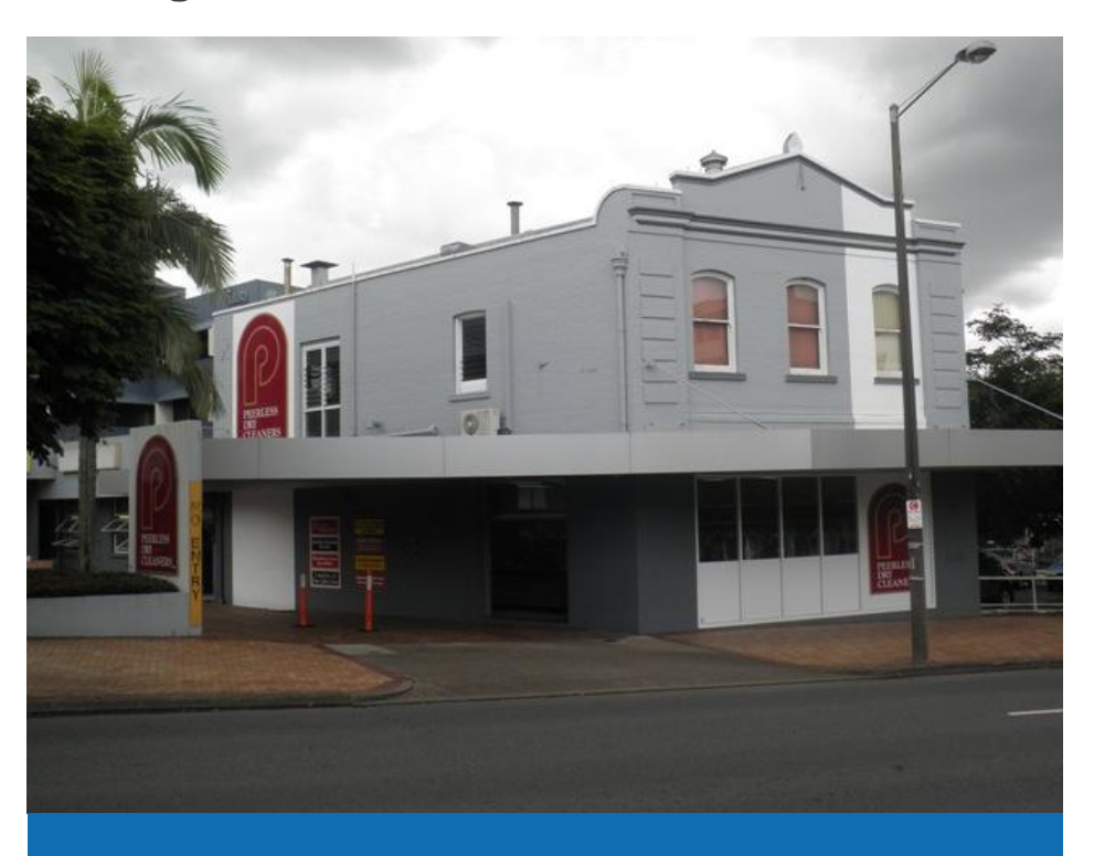
Carver and Co. building (former)