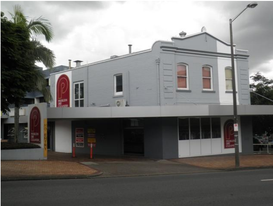
Carver and Co. building (former)