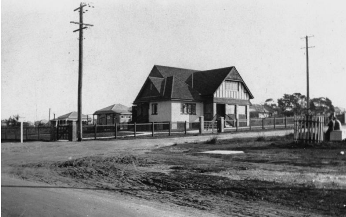
'House in Rode Rd, Nundah, 1930'