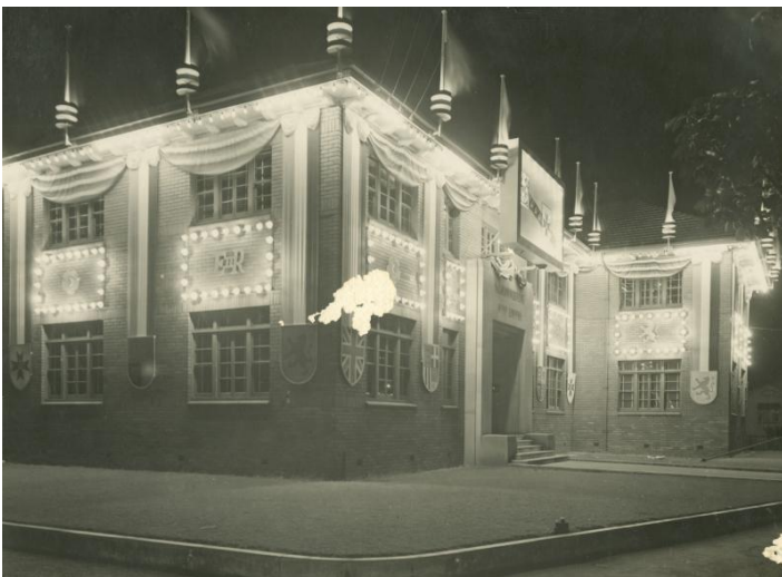
'Hornibrook House lit up for the Queen's visit in Newstead, Queensland, 1954'