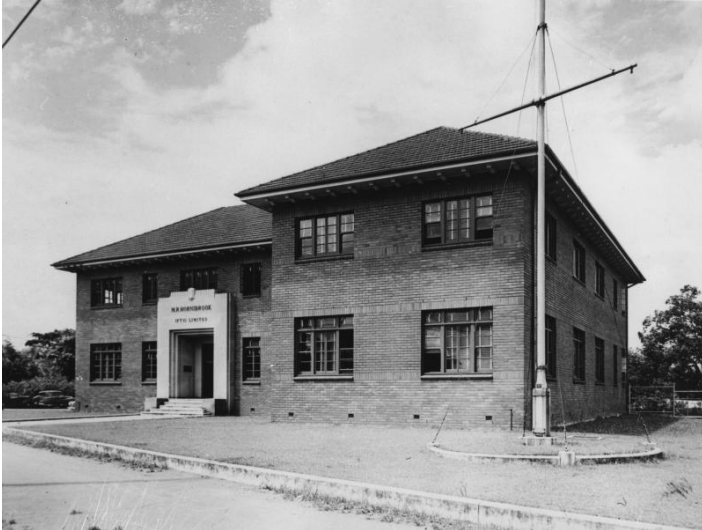
'Headquarters of M.R. Hornibrook (Pty) Limited in Newstead, Brisbane, ca. 1945'