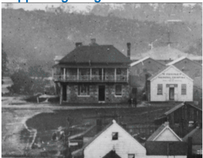
Detail view of the image 'Charlotte Street, Brisbane, during the 1864 flood', showing the Prince of Wales Hotel (current Victory Hotel)