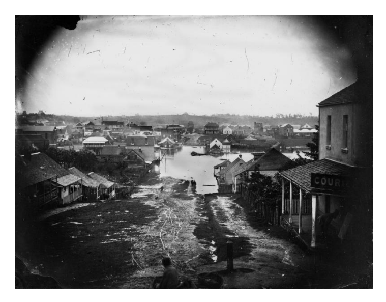
'Charlotte Street, Brisbane, during the 1864 flood'