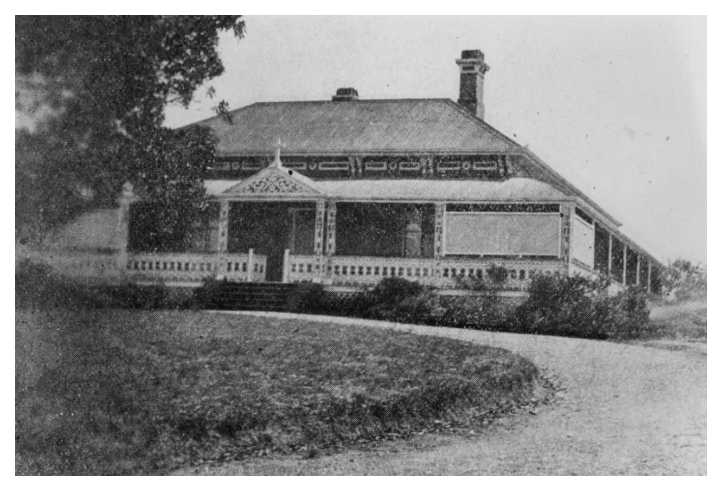
Convent of the Good Samaritan order, Coorparoo, ca. 1918 (Source: State Library of Queensland, Negative No. 158104).